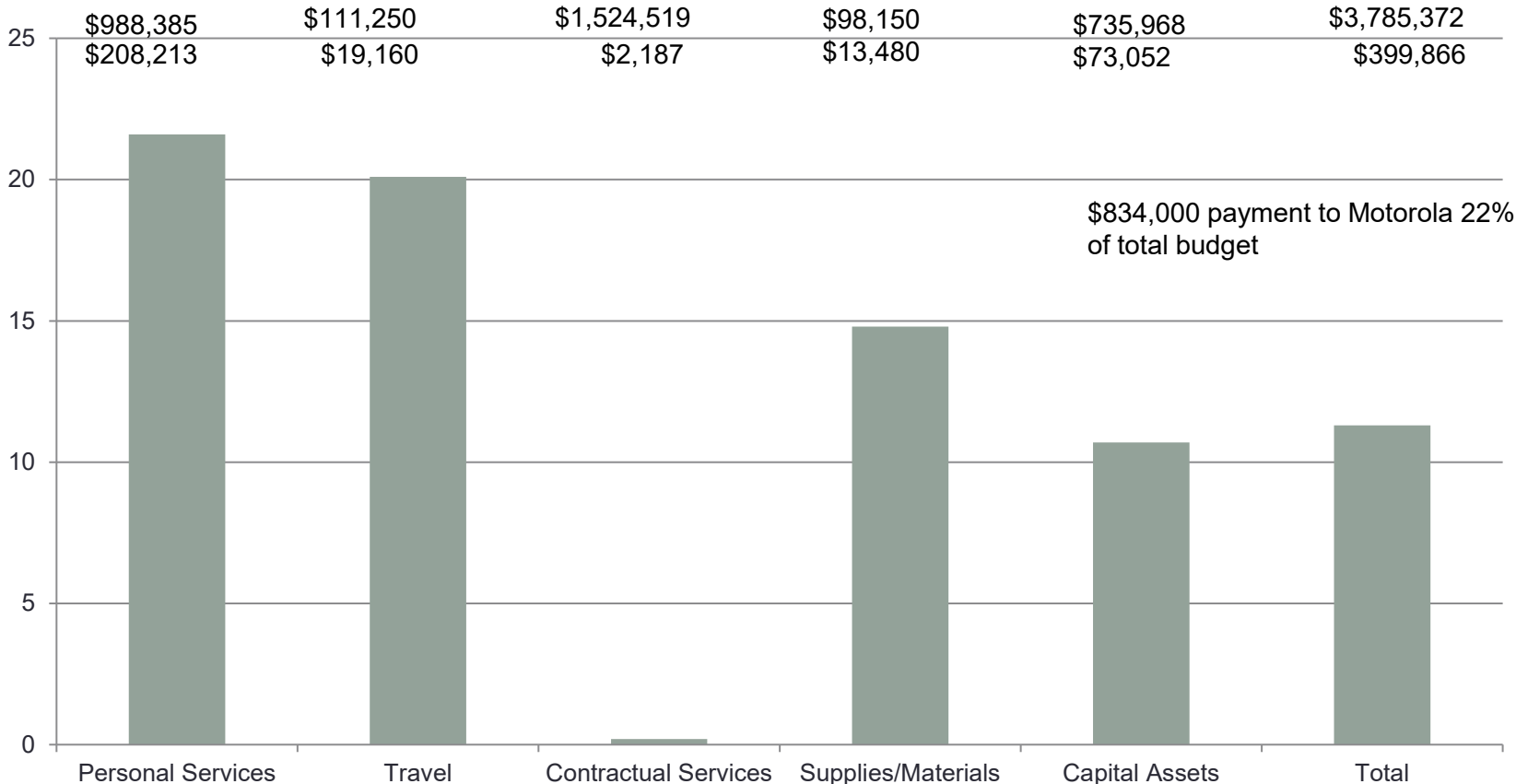
FY22 Budget 13% Remaining